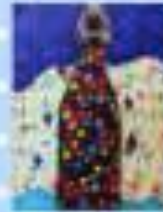
Tilda Beaumont Year 4