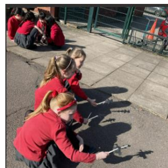
Y3 Exploring creativity and light with shadow puppets.