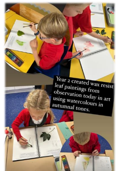
Year 2 created wax resist leaf paintings from observation today in art using watercolours in autumnal tones.