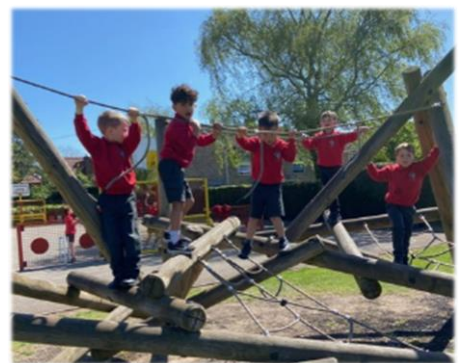
We have enjoyed some lovely sunny playtimes this week!